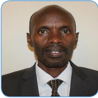
KALIWABO Charles Umucamanza mu Rukiko rw'Ubujurire

Justice KALIWABO Charles yavuze ko ikibazo gikomeye ari ibura ry'ibimenyetso bihagije bituma umucamanza yabura aho ashingira aca urubanza. Yavuze ko Inkiko zemeranywa n'abanyarwanda ko guhohotera umwana ari icyaha gikwiye kutajenjekerwa ari ko nanone umucamanza atagomba kwibagirwa ko ihame ari uguhamya umuntu icyaha ari uko hari ibimenyetso simusiga bikimuhamya. Yavuze ko hari igihe abacamanza batinya pression sociale bakaba bahana umuntu nta bimenyetso bafite byagera mu rukiko rw'ikirenga urega akaba umwere. Yasabye ko niba nta bimenyetso ubushinjacyaha bufite bajya bashyingura dosiye aho kuyizana mu nkiko baziko nta bimenyetso bihagije bafite.