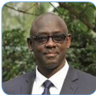
BUSINGYE Johnston Ministiri w'Ubutabera

Ministiri w'Ubutabera BUSINGYE Johnston yatangiye avuga ko Ministeri ayoboye igira uruhare runini mu ishyirwaho ry'amategeko anongeraho ko gushyira mu bikorwa amategeko ku bacamanza benshi bigorana kubera ko batayumva kimwe.